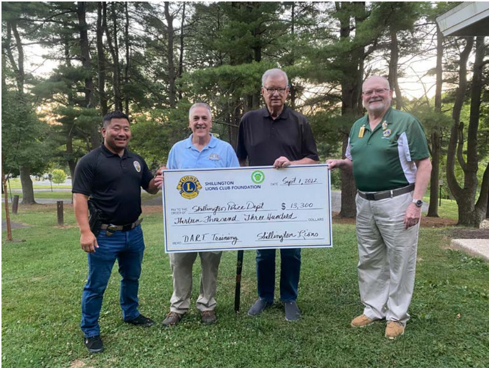
Shillington Lions, 14-P