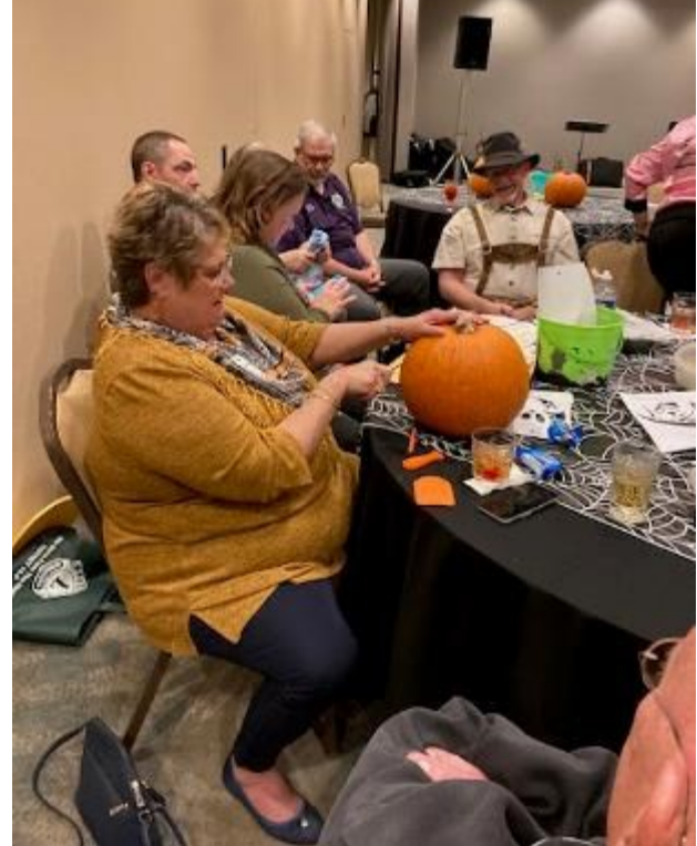
Lion Jeanie tried her hand at pumpkin carving. .