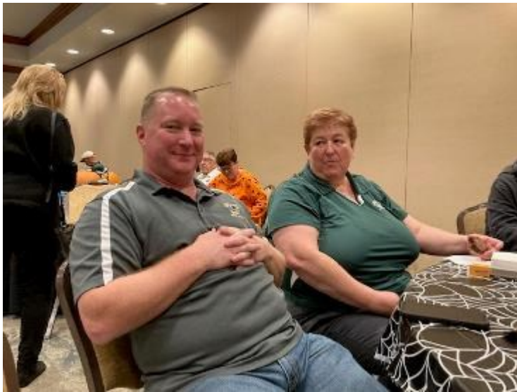
The last weekend in October was the State Council meeting which included a Halloween themed Hospitality night.