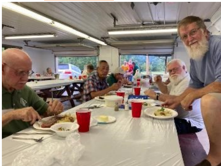
Members of the Lafayette Lions Club.