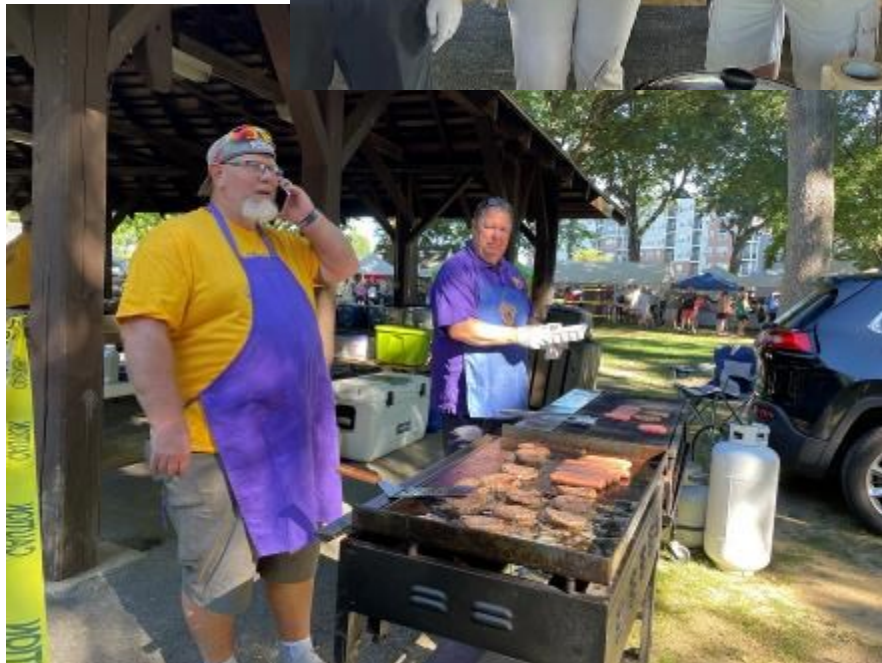
Lititz Lions Club food stand in Lititz Springs Park during the Rotary Club Craft Show