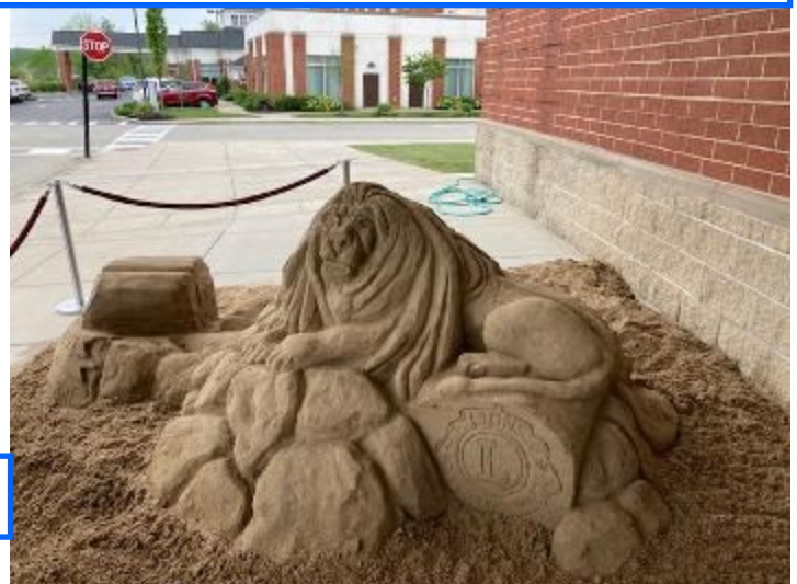
Sand sculpture done by a local artist