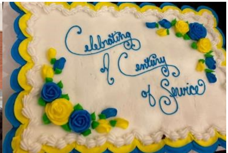
Pennsylvania Lions, MD-14 celebrated their 100th anniversary