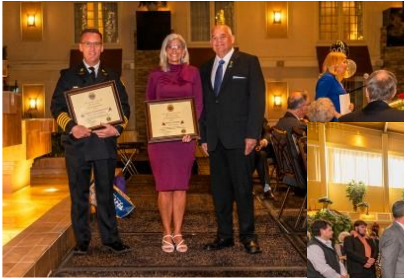
Lancaster's 100th celebration award winners