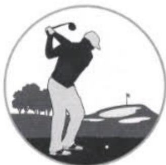
Last Year's Sign