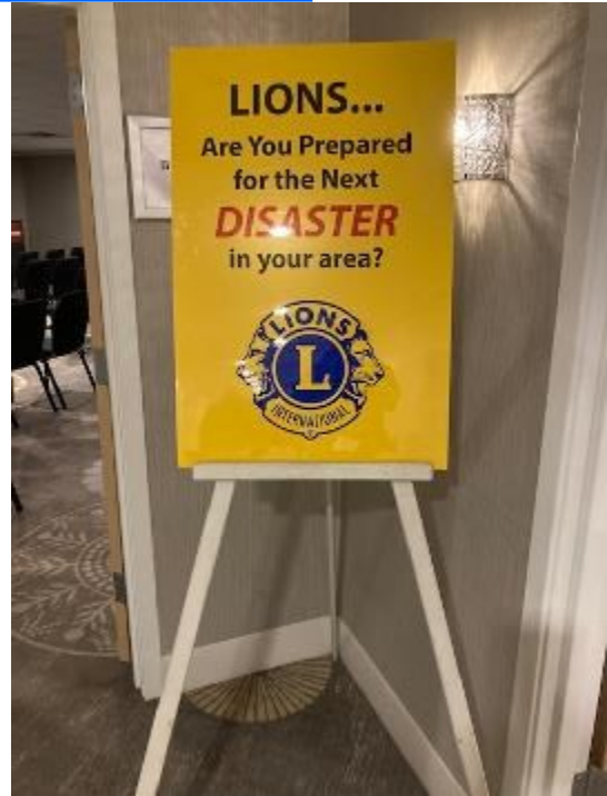
Disaster Relief Presentation at State Convention