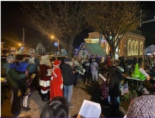
The holiday season is a busy, but fun time for the Palmyra Area Lions Club. Over the past month, the club participated in the Campbelltown's 3 rd Annual Holiday Tree Lighting event, hosted their own Palmyra Tree Lighting event, and welcomed Santa and Mrs. Claus to the Square in Palmyra.