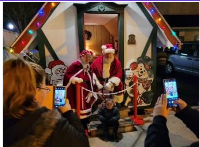
The club's most recent event, Reindeer Night at the Square, had a record attendance of over 600 visitors who came to see Santa's reindeer "Snow", Santa, Mrs. Claus, and the Grinch! The event was complete with food trucks and members of the Palmyra Area High School Alumni Marching Band, who sang carols to the crowd.