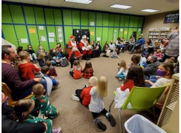
The club also recently partnered with the Palmyra Public Library to host a Storytime with Santa, which included a reading of 'Twas the Night Before Christmas, the opportunity for children to visit with Santa and Mrs. Claus, and books and cookies to-go!