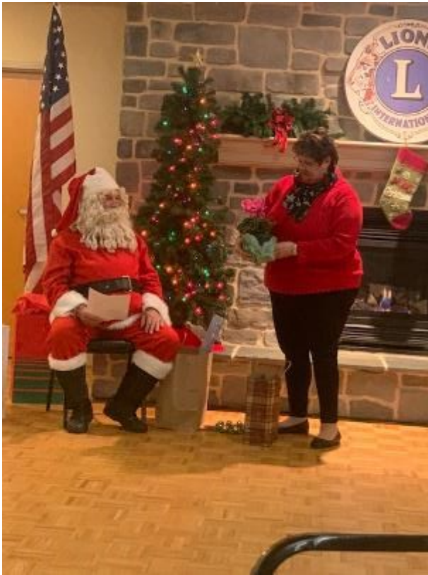
Part 2 of the Willow Street Lions club holiday party with Santa.