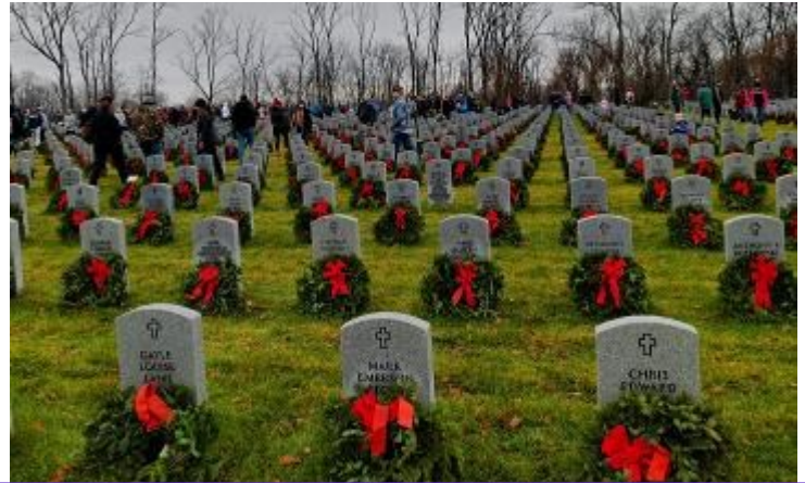
In addition to all of the Christmas festivities, the club also took some time to honor our U.S. veterans by participating in a Wreaths Across America Day Ceremony and General Wreath Laying event at Indiantown Gap National Cemetery. They also created holiday cards to be mailed to veterans at the Lebanon VA Medical Center.