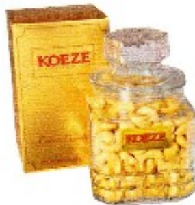
Colossal Cashews starting at $19.95

It's the Lancaster Lions Club annual fundraising sale of Koeze gourmet treats! It's been a hard year—treat yourself or someone you love with the gift of Koeze!