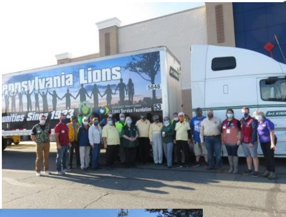
Lions at Lowes that volunteer to load the truck. Thank Lowes for their forklift