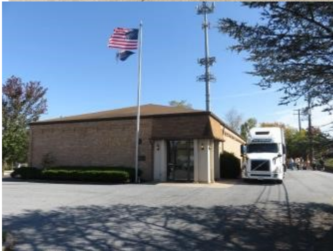
Below are photos of Lions loading at the Harrisburg State Office