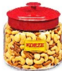
Mixed Nuts starting at $18.95