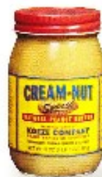
Natural Peanut Butters starting at $6.49