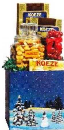
Gift Boxes starting at $45.95