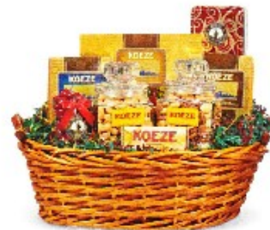
Gift Baskets starting at $97.95