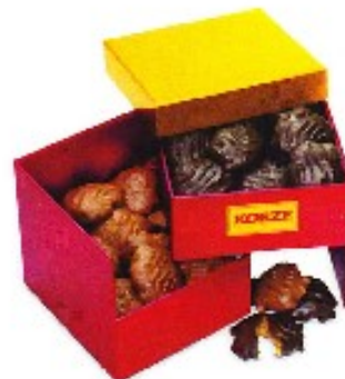
Caramel Turtles starting at $19.95