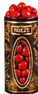
Chocolate Covered Fruit starting at $16.50

...and lots more! Browse the catalog or visit Koeze.com to see what else is available! or contact us at weserve@lanasterlionsclub.com to order