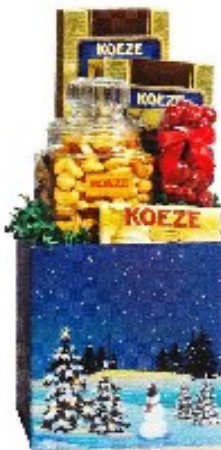
Gift Boxes starting at $45.95