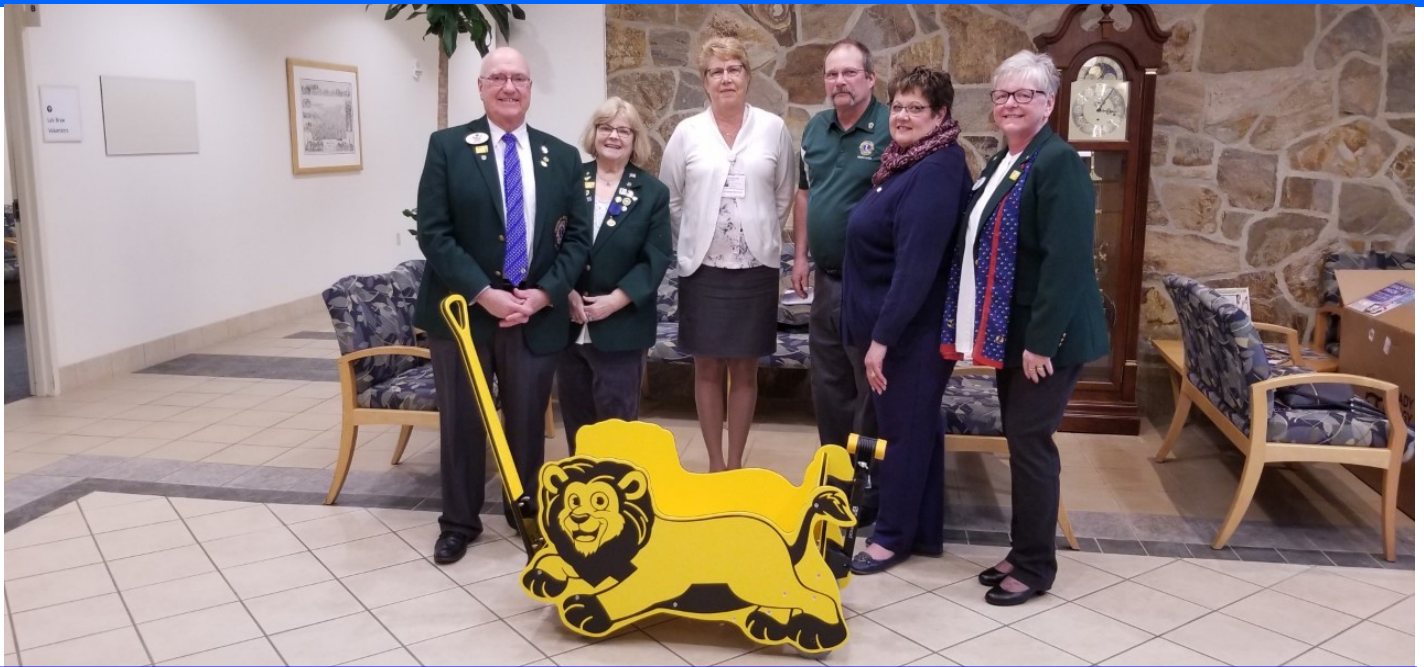
Willow Street Lions Club donated a Lion Brady Buggy Wagon to UMPC Hospital in Lititz. It will be used in the Emergency Unit for children. UMPC was so thrilled to receive another one. The children love them.