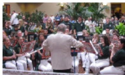
Hear our All State Band in concerts Saturday at 11 a.m. and 4:45 p.m. Show your pride in our band and support one of our youth projects by attending one or both band concerts.