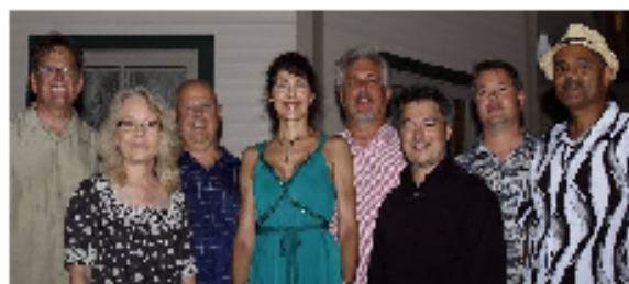
The Fabulous Cheeze Brothers and Sisters will entertain during Friday evening's Hospitality Night.