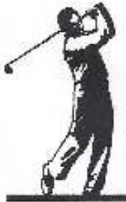
Last Year's Sign