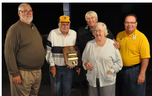
Six Lions (photo on right) from 14D attended the USA/ Canada Forum in Tampa, Florida, in September. They were among 103 Lions from PA and 2,150 Lions who attended.

**Optional contribution not needed for 100% club.