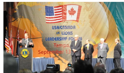
Scenes from the USA/ Canada Forum