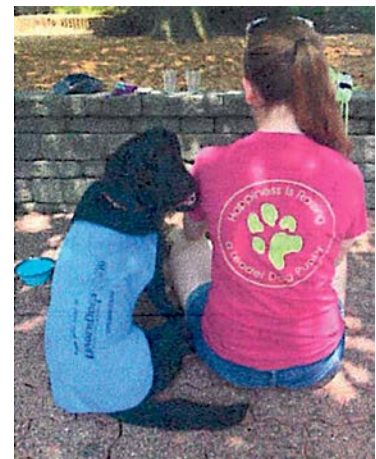
A Puppy's Journey to Be a Leader Dog