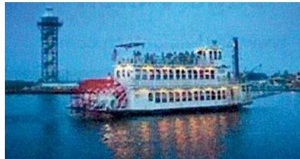
Thursday: Dinner Cruise on Victorian Princess